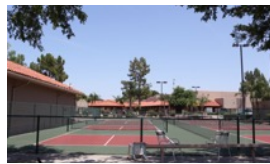
ACTIVITIES KEEPING BUSY