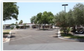
IMPROVEMENTS SEE THEM HERE